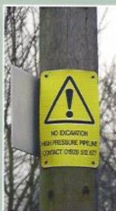
Pole warning marker