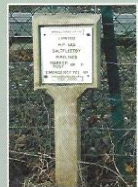
Wingas marker post