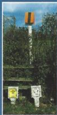
Esso & MLP aerial marker