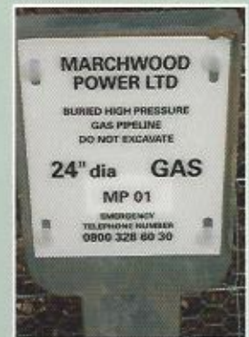
Marchwood Power post