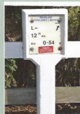
Mainline marker post