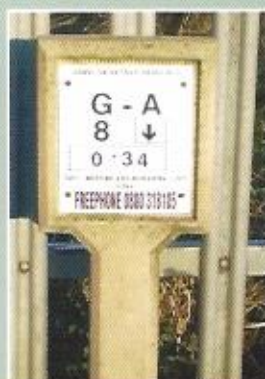
SABIC marker post