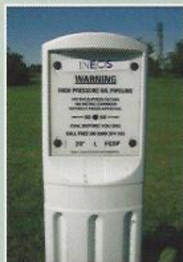
Ineos marker post