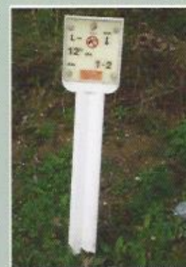
Total marker post