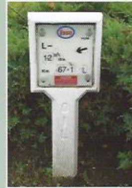
Esso marker posts