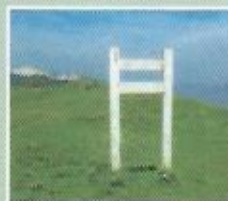
Stile warning marker

Sometimes metal studs are used in roads and pathways