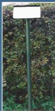
Wingas aerial marker