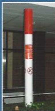
National Grid Gas

Each operator has similar aerial markers to left