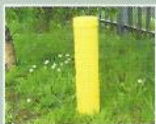
Post warning marker

When the pipeline route has been located it will be marked with location pegs.