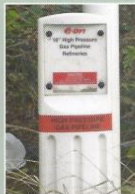
EON marker post