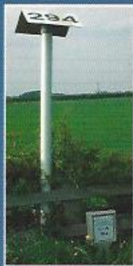
Essar aerial marker