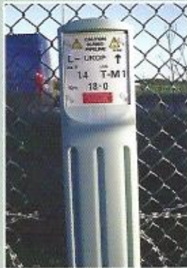
BPA marker post