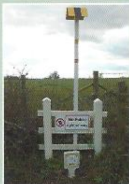
CLH marker post