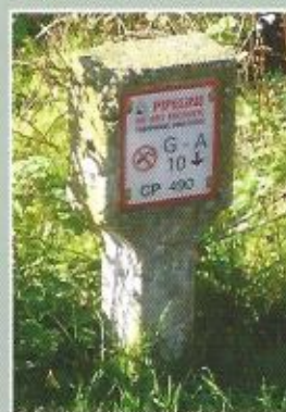
Essar marker post