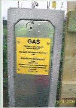
Centrica marker post