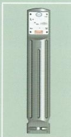
New design marker post