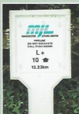
MJL marker post